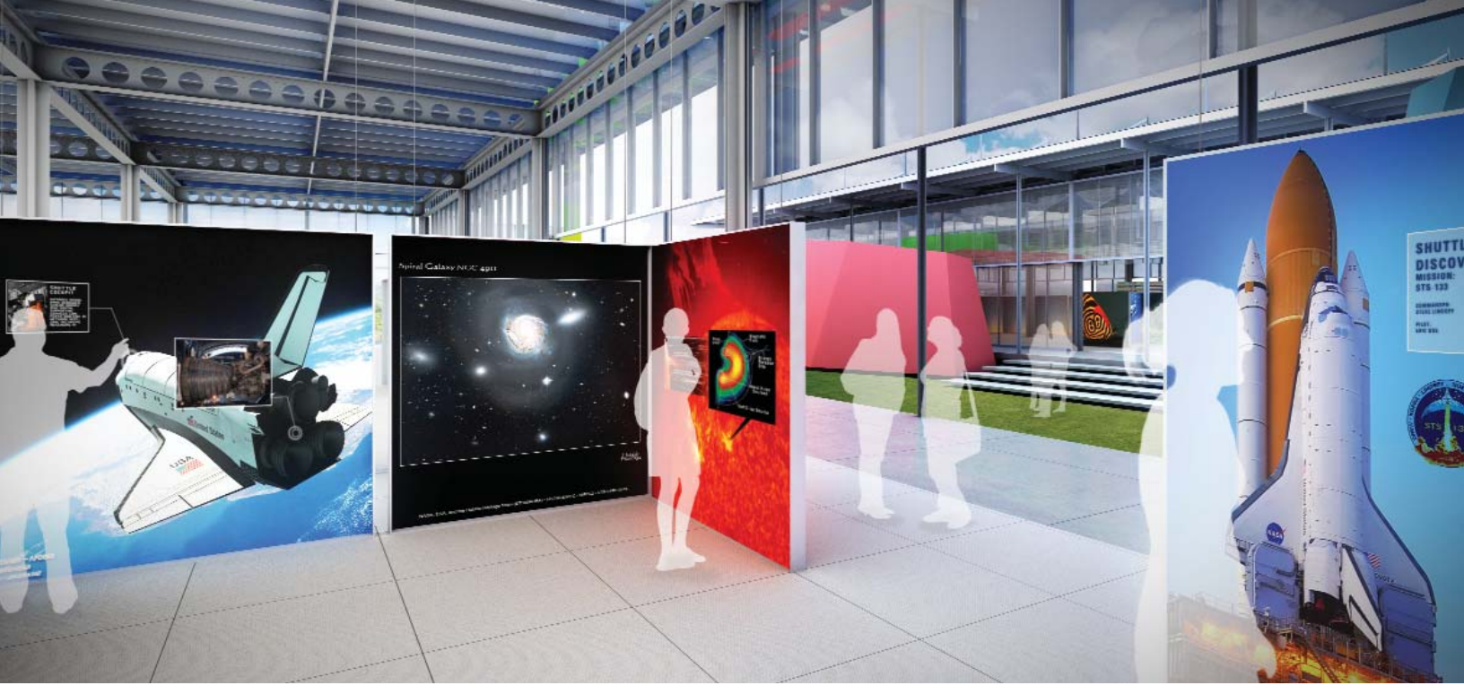
Classroom of the Future

academic learning, this space becomes communal space, an environment shared between students, guests and citizens alike. Rendered as a vertical space, this dynamic space unites all learning academies.